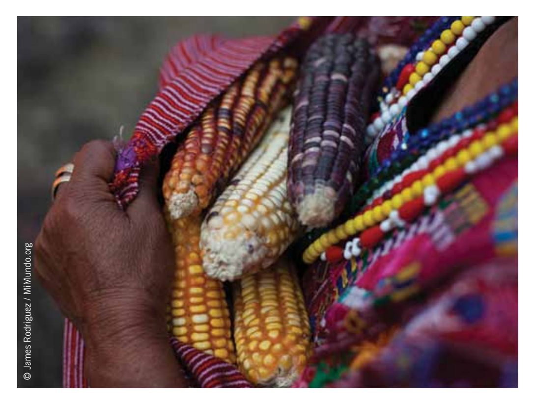
Detail of corn being carried during celebrations at the ancient Mayan site of Zaculeu to mark the end of the Mayan Era known as 13 Baktun. Zaculeu, Huehuetenango, Guatemala. December 21, 2012.

The UN Committee on the Elimination of Racial Discrimination (CERD) released a report on Guatemala on March 16, 2010 in which it evaluated Guatemala's implementation of the Convention on the Elimination of All Forms of Racial Discrimination . The Committee expressed concern that Guatemala had not implemented the UN Declaration on the Rights of Indigenous Peoples by instituting provisions for free, prior and informed consent. Further, it called on the State to establish consultation processes to bring it in line with its obligations under ILO 169<sup>130</sup> and to adopt a consultation law to enshrine the right of Indigenous peoples to free, prior and informed consent.<sup>131</sup>