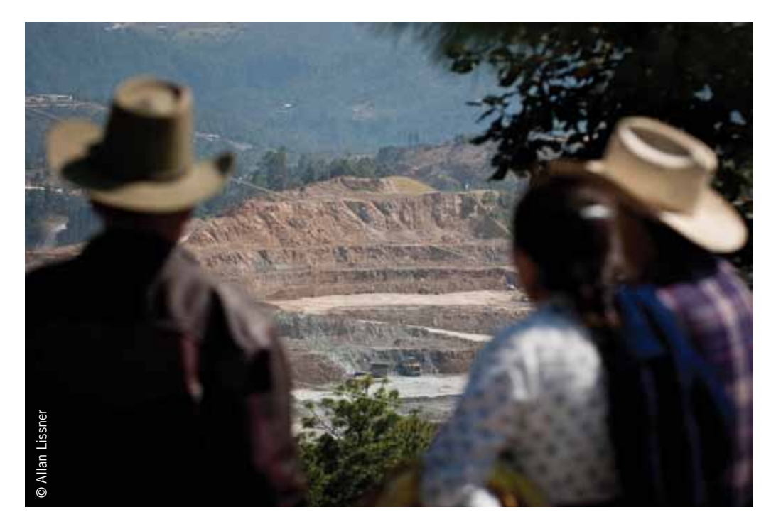
Community members look down on Marlin Mine from the surrounding hillside. San Miguel Ixtahuacan, Guatemala.

Canada – like many other States – has shown itself willing to take action with extraterritorial effect to promote and protect corporate interests. The failure to take action – in line with the requirements and recommendations of UN human rights treaty bodies – to effectively regulate Canadian companies operating abroad is enabling these companies to benefit from human rights abuses occurring outside of Canada.