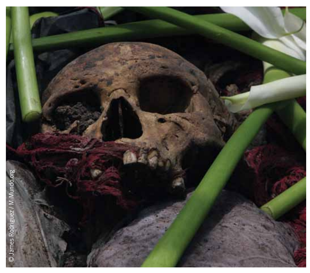
Formal ceremony at the La Verbena Cemetery in Guatemala City. The Guatemalan Forensic Anthropology Foundation (FAFG) undertook a complex and ambitious project to search for, exhume and match with living relatives remains found of the 45,000 detained-disappeared victims of Guatemala's internal armed conflict during the 1970s and 80s. To date, they have identified 1,592 victims whose remains were recovered from clandestine graves. Guatemala City, Guatemala. February 26, 2010.

In Guatemala approximately 30 per cent of the population lives in extreme poverty.<sup>28</sup> Since the end of the internal conflict, successive governments have proposed economic development plans with a particular focus on the extraction of mineral resources (mostly gold, silver and nickel). Mining therefore has boomed in the last decade.