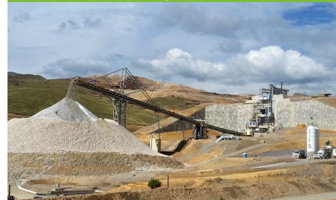
Constancia Primary Crusher