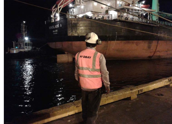
First Constancia concentrate vessel departing for China