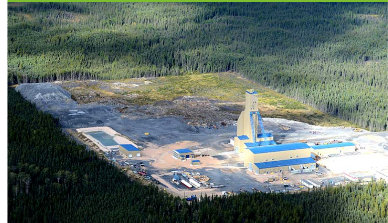
Aerial view of Lalor