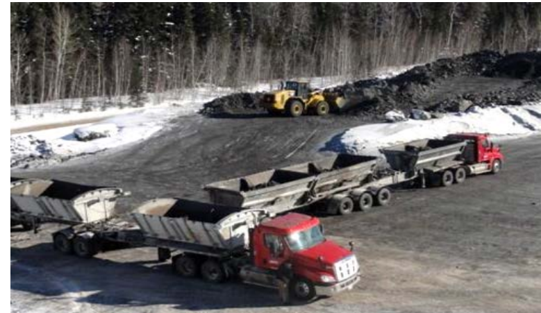
Loading ore for transportation from Reed to Flin Flon